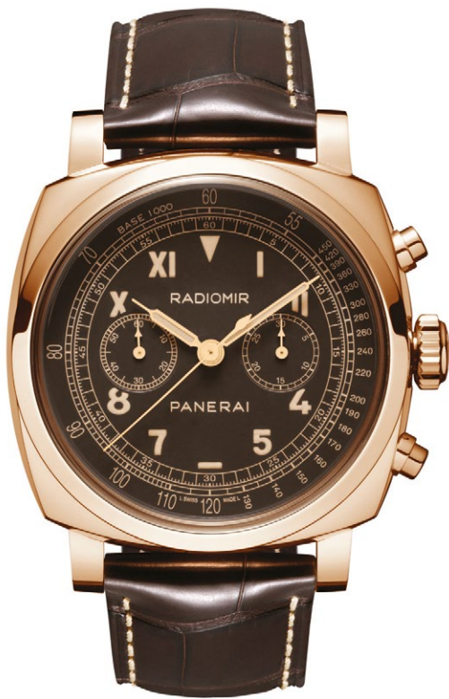
Duomètre à Grande Sonnerie - Case: Diameter 45 mm, 18 ct. polished red gold. - Movement: Hand-wound mechanical, exclusive Panerai OP XXV calibre, 12 - Strap: PANERAI personalised alligator strap and 18 ct. polished red gold adjustable buckle.

Panerai Radiomir 1940 Chronograph In 1916, Panerai created Radiomir to meet the military requirements of the Royal Italian Navy! In 2014, Radiomir 1940 Chronograph has been developed with a new calibre hand-wound chronograph with a diameter of 12. Supplied with an alligator strap, this gorgeous piece conveys the elegance and spirit of the 1940s.