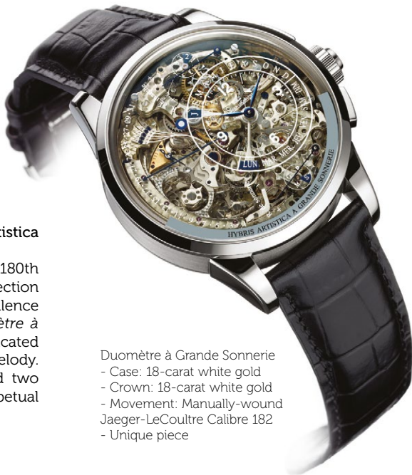
Duomètre à Grande Sonnerie - Case: 18-carat white gold - Crown: 18-carat white gold - Movement: Manually-wound Jaeger-LeCoultre Calibre 182 - Unique piece

Jaeger-LeCoultre Duomètre à Grande Sonnerie 2014 Hybris Artistica Collection Jaeger-LeCoultre, which was celebrating its 180th anniversary last year, has created a unique collection of twelve pieces which demonstrates the excellence of this beautiful Maison: Hybris Artistica. Duomètre à Grande Sonnerie was in 2009 the most complicated watch in the world with its famous Big Ben melody. This new piece presents a rock crystal dial and two other complications: a flying tourbillon and a perpetual calendar with retrograde hand!