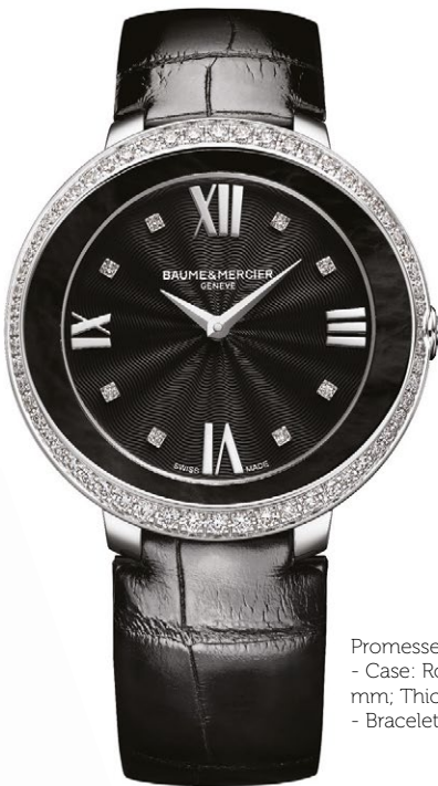
Promesse 10166. - Case: Round Diameter 34.4 mm; Thickness 8.16mm - Bracelet: Glossy black Buckle: Pin buckle