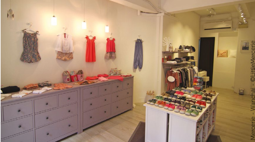
Mercerie - Wanchai - @littleMercerie

The friendship between two expatriate French women living in Hong Kong lies at the origin of this children’s clothing brand created in 2006. Since 2011, Little Mercerie has continued to grow, thanks to a new team. And so two years after the first retail outlet was opened in Aberdeen Street (Central), the brand has also recently opened up in the Wan Chai district. Over the years, Little Mercerie has continued to win over mums and their children with collections that are a fresh modern twist on the classics. The smocks and dresses in delicately gorgeous Liberty prints are to die for! The clothes have a simple, comfortable cut and a high quality finish. Chic essentials in beautiful fabrics for unassuming elegance! They make an ideal everyday wardrobe, giving boys and girls between the ages of 6 months to 12 years great freedom of movement. Also in store is the essential Bensimon canvas shoe collection, in a wide range of colours, for all ages. One of Proust’s madeleines or that little French touch complete the outfits so beautifully! And if you can’t get to the stores, you can always shop on-line at your leisure on their website.