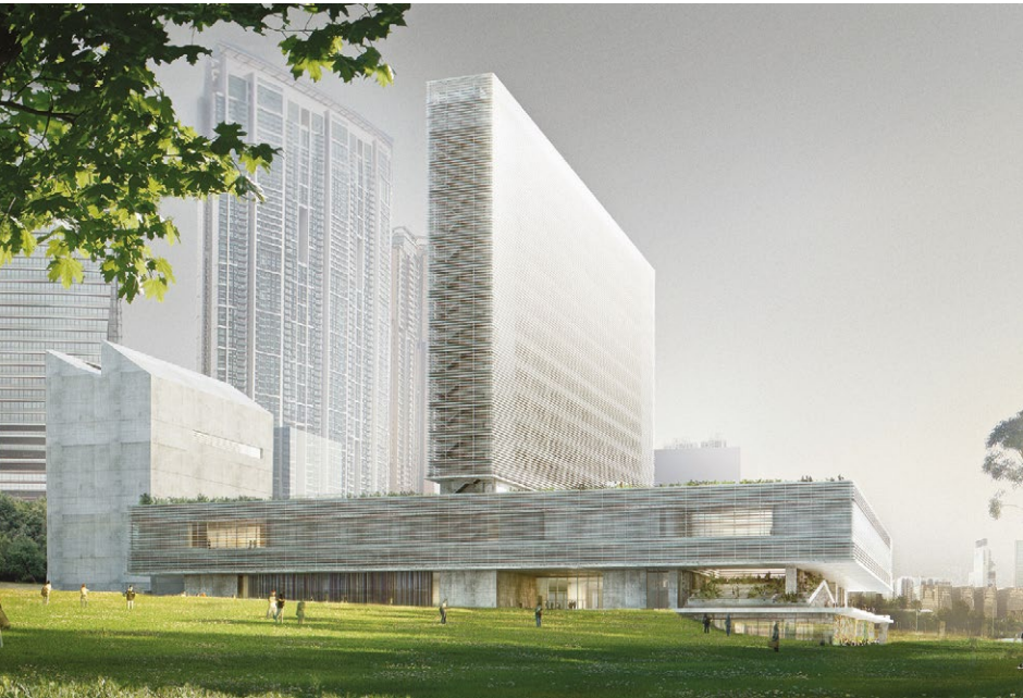
View of M+ from the Park at WKCD