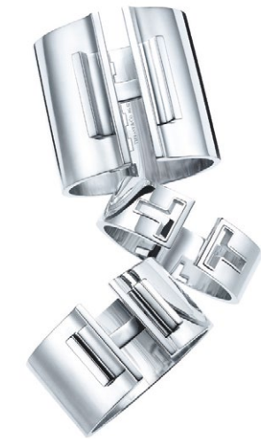
Tiffany T cuffs in sterling silver (from top): Bar cuff wide, Cut-out cuff, Bar cuff