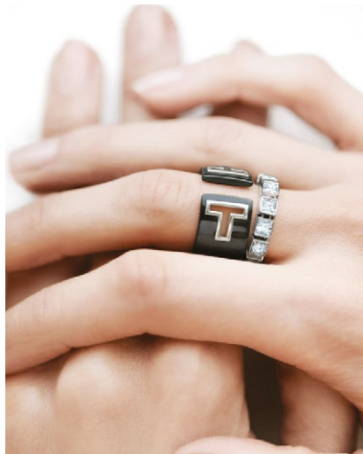
Tiffany T (from left): Cut-out Ring in sterling silver with black ceramic, Diamond Ring in 18K white gold