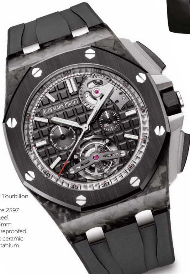
Royal Oak Offshore selfwinding Tourbillon Chronograph - Movement: Selfwinding Calibre 2897 with tourbillon and column-wheel chronograph. Total diameter 35mm - Case: Forged carbon case, glareproofed sapphire crystal caseback, black ceramic bezel, crown and pushpieces, titanium pushpiece guards

A. Lange & Söhne The LANGEMATIK PERPETUAL Ferdinand A. Lange established his watch manufactory in 1845. After World War II, the company was expropriated, and A. Lange & Söhne nearly disappeared. In 1990, Ferdinand A. Lange's great-grandson Walter decided to relaunch the brand! 20 years on and 49 manufactured calibres later, A. Lange & Söhne has today developed the beautiful LANGEMATIK PERPETUAL IN white-gold case and black dial.