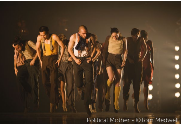
Political Mother