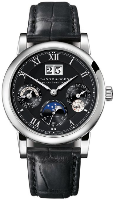
LANGEMATIK PERPETUAL - Case: Diameter: 38.5 millimetres; height: 10.2 millimetres; White gold - Strap: Hand-stitched crocodile strap, black

Vacheron Constantin Traditionnelle World Time Collection Excellence Platine Created in 2006 and celebrating a pure, rare and eternal material, the Collection Excellence Platine by Vacheron Constantin welcomes two new models including the Traditionnelle World Time capable to displaying 37 time zones. Designed, developed and produced by the Vacheron Constantin Manufacture... "Do better if possible and, that is always possible!"