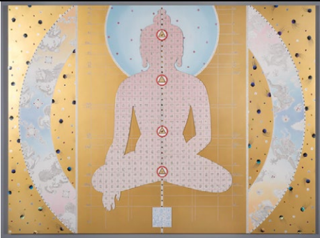
Gonkar Gyatso - Pendulum of Autonomy - 2014 60 x 80 inches - Mixed Media collage and dibond on aluminium honeycomb panel

Considered the most significant Tibetan contemporary artist working today, Gonkar Gyatso (b.1961) is actually a transnational artist who studied in Beijing and later at Central St. Martins College in London. Mixing traditional Buddhist iconography with pop cultural referents and mass-media elements, he questions what is considered traditional, whilst addressing the many new cultural hybrid identities to which globalisation has given rise. Much of Gyatso's work mixes different media, from ink painting to collages, stickers and cut-out texts, reflecting his own vision of the coexistence of many aspects of human society. For this solo exhibition entitled Pop Phraseology at Pearl Lam Gallery, the artist focussed on phrases found in popular culture. Known primarily for his works portraying the Buddha without a face, Gyatso touched on both social and political themes while remaining in his own highly personal and often humoristic universe.