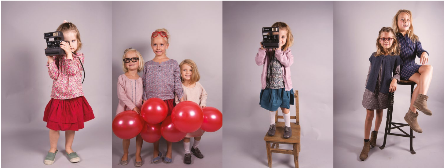
Juliet & the Band - 201D, Level 2, The Pulse - 28 Beach Road, Repulse bay, Hong Kong - www.julietandtheband.com

If you had to choose one fabric? One colour? One shape? Liberty of London fabrics; Red; A timeless shirt, that a child can wear all year long!