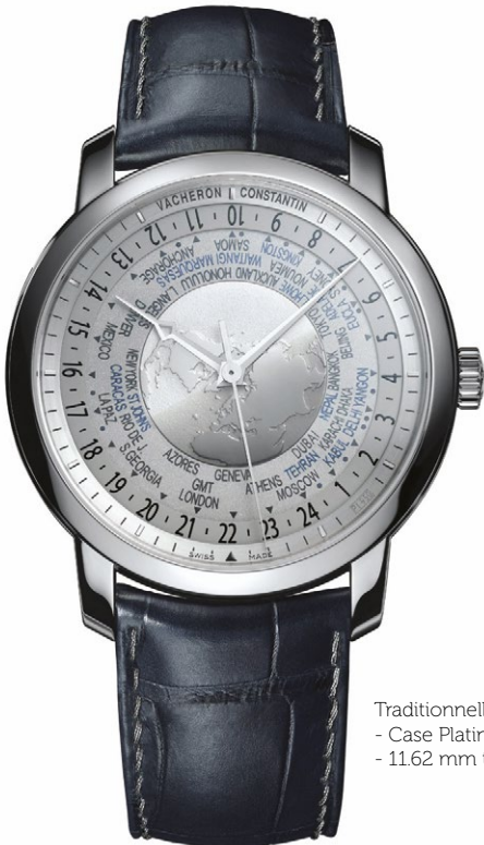
Traditionnelle World Time Collection Excellence Platine - Case Platinum 950, 42.50 mm diameter - 11.62 mm thick, Transparent sapphire crystal caseback

Vacheron Constantin Traditionnelle World Time Collection Excellence Platine Created in 2006 and celebrating a pure, rare and eternal material, the Collection Excellence Platine by Vacheron Constantin welcomes two new models including the Traditionnelle World Time capable to displaying 37 time zones. Designed, developed and produced by the Vacheron Constantin Manufacture... "Do better if possible and, that is always possible!"