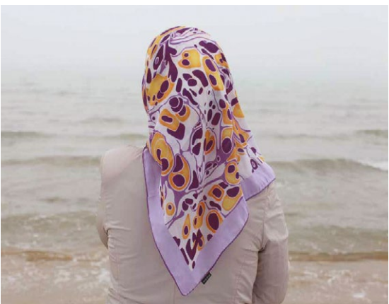
«VOIR LA MER»: 'I went to Istanbul, a city surrounded by water, I met people who had never seen the sea. I filmed their first time.'

SOPHIE CALLE and AIDA MAKOTO: from November 26th to December 26th Galerie Perrotin – 17F, 50 Connaught Road, Central, Hong Kong +852 3758 2180 – www.perrotin.com