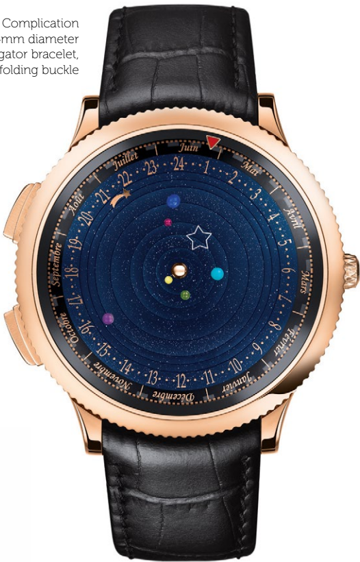
Midnight Planétarium Poetic Complication - Pink gold case, 44mm diameter - Black alligator bracelet, pink gold folding buckle

Van Cleef & Arpels Midnight Planétarium Poetic Complication Six years after the launch of the Lady Arpels Jour Nuit model, Van Cleef & Arpels takes us into the stars! The Midnight Planétarium Poetic Complication symbolizes a picture of planets moving around the Sun in real time! Poetic as usual and absolutely unheard-of!