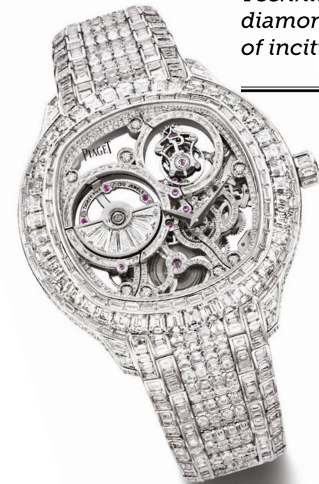
Emperor Coussin Exceptional Piece - 18K white gold case, 49 mm - Ultra-thin self-winding diamond-set skeleton tourbillon

Time will stand still in Hong Kong from 29th September to 2nd October this year with the second edition of Watches & Wonders. Technical prowess, demonstrations of craftsmanship, scintillating diamonds, surprising designs..., the 2014 vintage fulfils its promise of inciting collectors' desires.