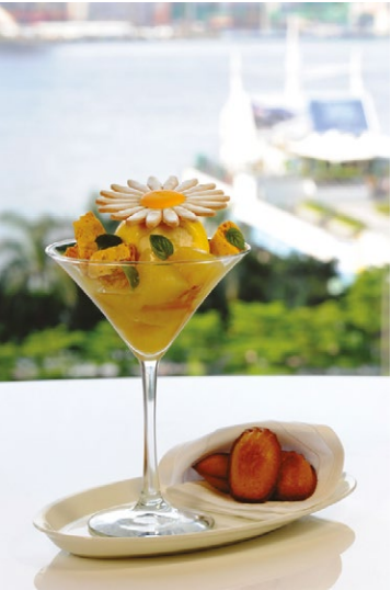
Chef Ringo Chan Ice Cream Sundae, Blossoming Honey

Four Seasons 8 Finance Street, Central, Hong Kong +852 3196 8888 - www.fourseasons.com/hongkong